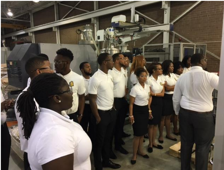
Core Technology Molding Corporation