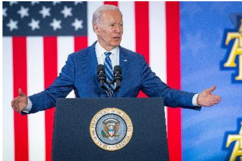
Bottom left , EPA Admin. Michael Regan ('98); center top, President Joe Biden; below, Olympian Allyson Felix; bottom right,NBA legend/entrepreneur Magic Johnson.