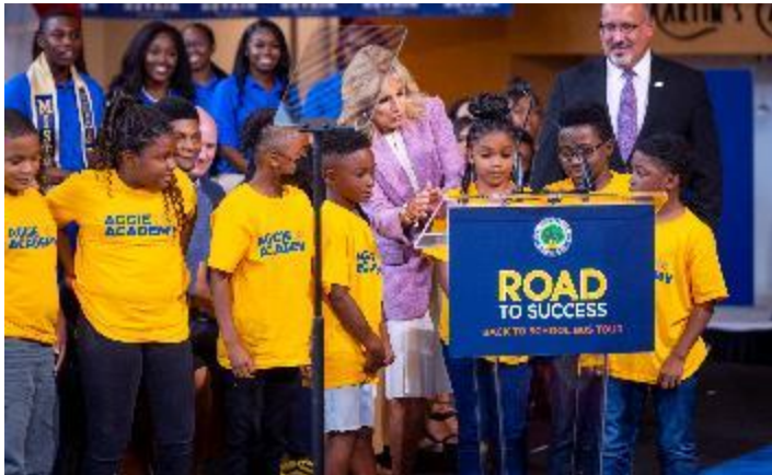
First Lady Dr. Jill Biden and U.S. Secretary of Education Miguel Cardona.